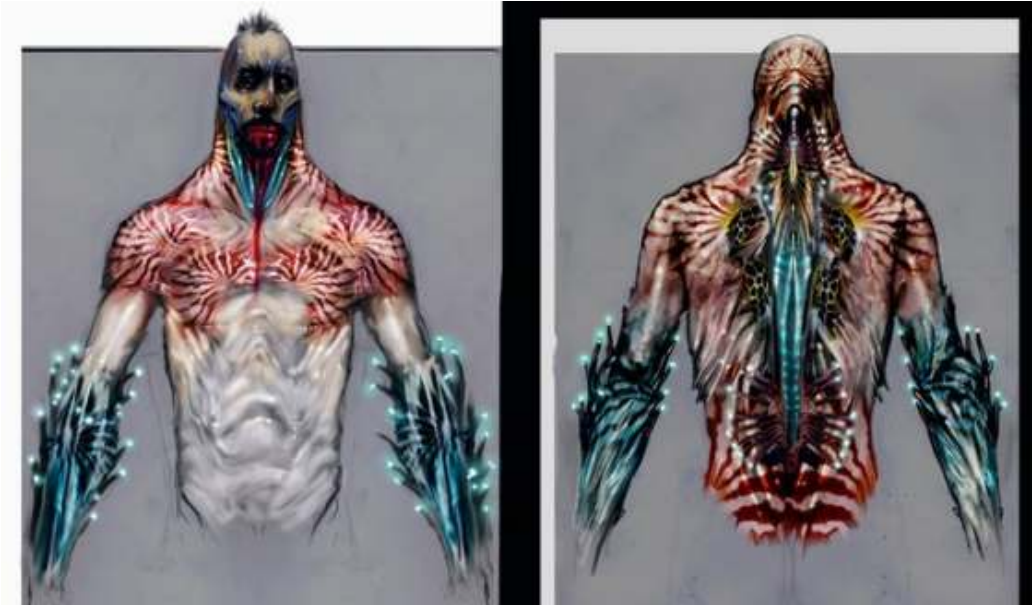
Figure 4: Voice of the dragons (D-baker)

Economically the Dracosphere is the source of biodesign par excellence, both inventing new designs whole cloth or doing contract work with other societies. It is also the major producer of Earth climate, selling climate control and weather maintenance to other societies – or at least many attempts are made to get it to play a proper part in the climate system. In exchange it buys information, various hard tech services like satellite communications and transport systems and syntronic processing.