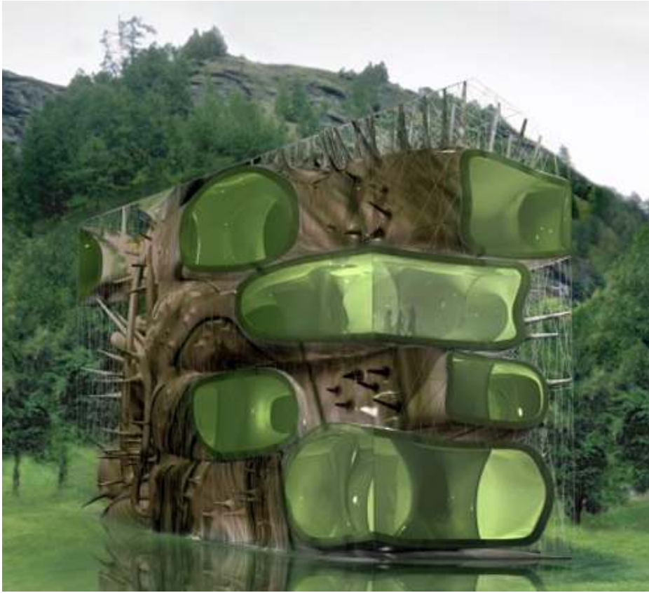
Figure 6: Biotech building (R&Sic(n))

Many small systems, as diverse as the major systems but involving far fewer people or areas exist.