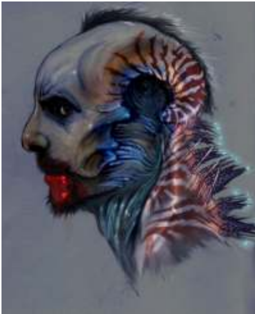
Figure 3: Voice of the dragos (D-baker)

The old Voice of the Dragons human community has now been entirely integrated. There remains a population of humanoid bodies used for personal interaction with other humans (especially at gateways like the New Orleans Castle).