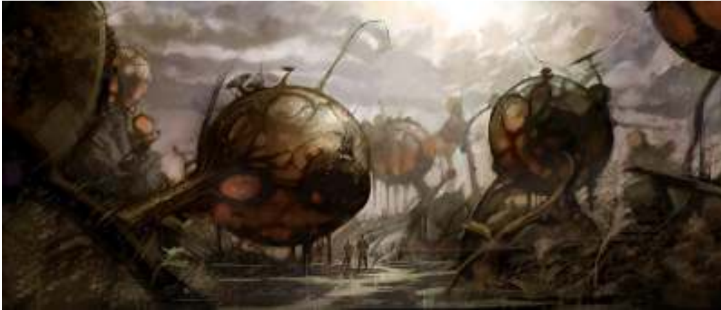
Figure 2: Dragon bloom (Chris J. Anderson)

The Dracosphere seems to be attempting to upload as much as possible of the old crustal Dragon civilization. To this end it sends down deep tendrils to pump up plasmids encoding its knowledge, and is sometimes willing to buy deep core samples from regions it does not have access to. It protects its existence in general terms, but none of its parts seems overly concerned about survival. The Dragons do not seem to have any clear agenda beyond this, but this is likely because they cannot be pinned down in human categories. Conversely, it does not seem to have any single opinion about humanity.