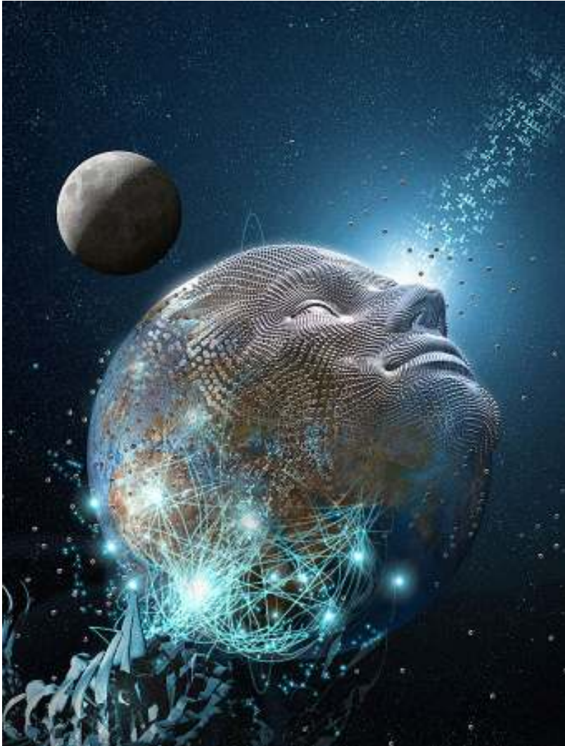
Figure 5 (Mondolithic studios)

The people with syntononic enhancements gradually found themselves forced together by circumstance and shared thinking. While they physically remained mixed with other groups of humans, their new modes of thinking set them apart and led to intriguing new possibilities. The possibility to link thinking and share memories and functions enabled the syntonics to work together. They could interface with AIs at enormous intimacy. The resulting system is often called the society of mind, after the ideas of 20th century AI researcher Marvin Minsky.