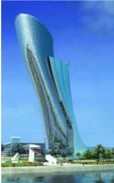
Figure 1: (Capital gate, Dubai)

2023 Start of the “fatwa war”, the use of untraceable online money to finance assassination attempts or reward killers of disliked persons.