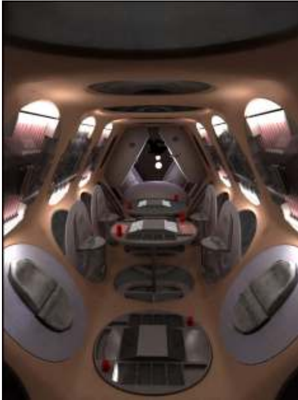
Figure 2 (Martinez)

Lotus, the world blames PSD and the Marshall Islands Rocketry Club. Shipyards in orbit around the moon.