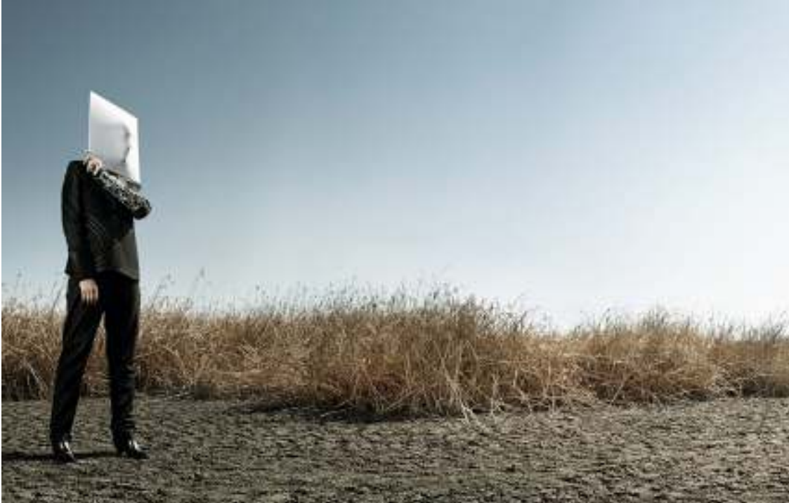
Figure 1: (Mladen Penev)