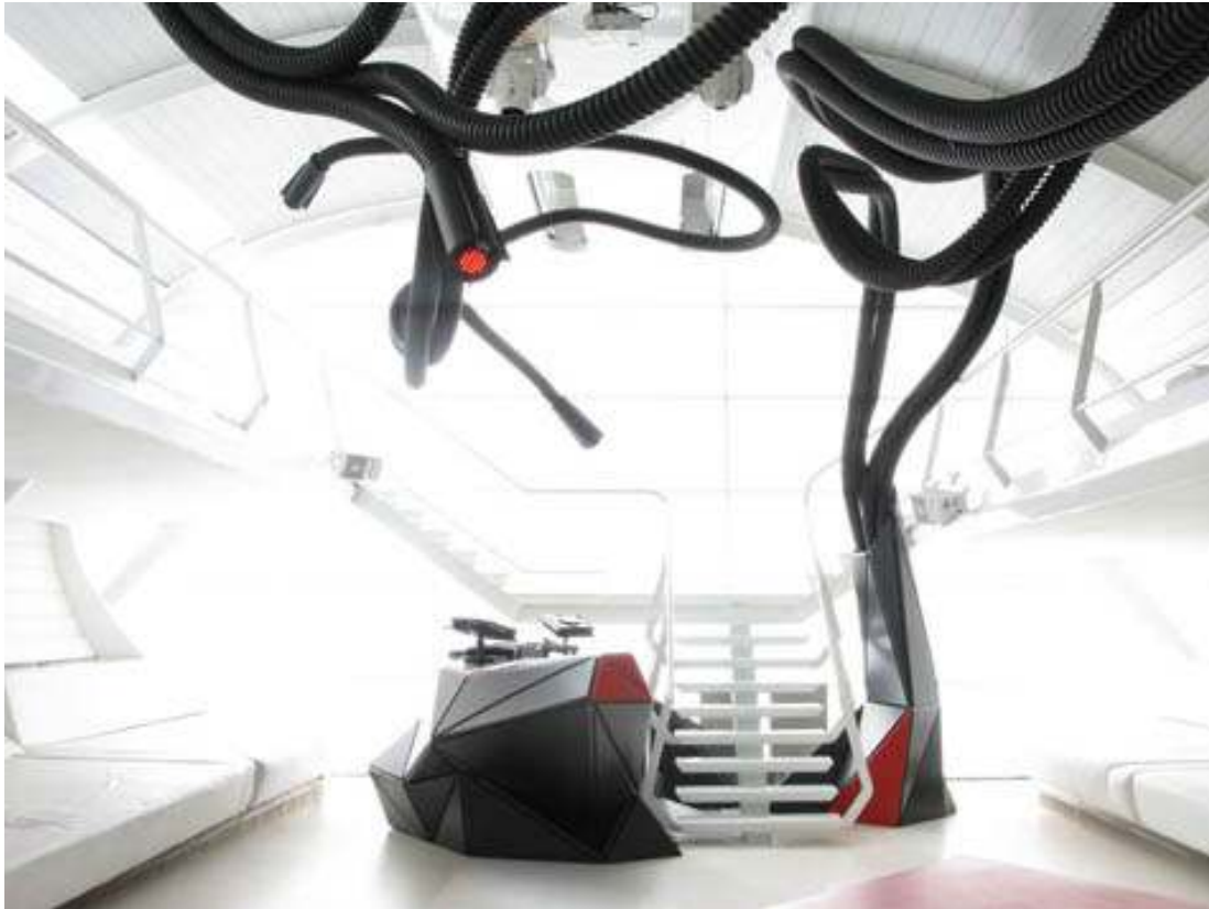
Figure 3: (Sebastien Weirinck)