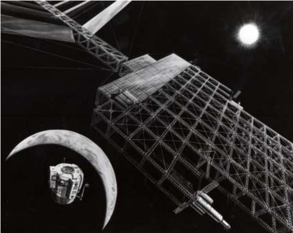
Figure 2 (NASA)