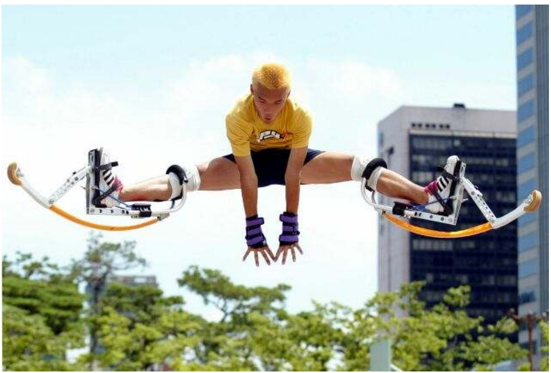
Figure 5: (Powerizer)

dominated by the generation coming into maturity during the mid-century Dragon crisis. They are willing to accept both the risks and duties involved in large-scale governance since they regard humanity as being fundamentally threatened by internal and external risks.