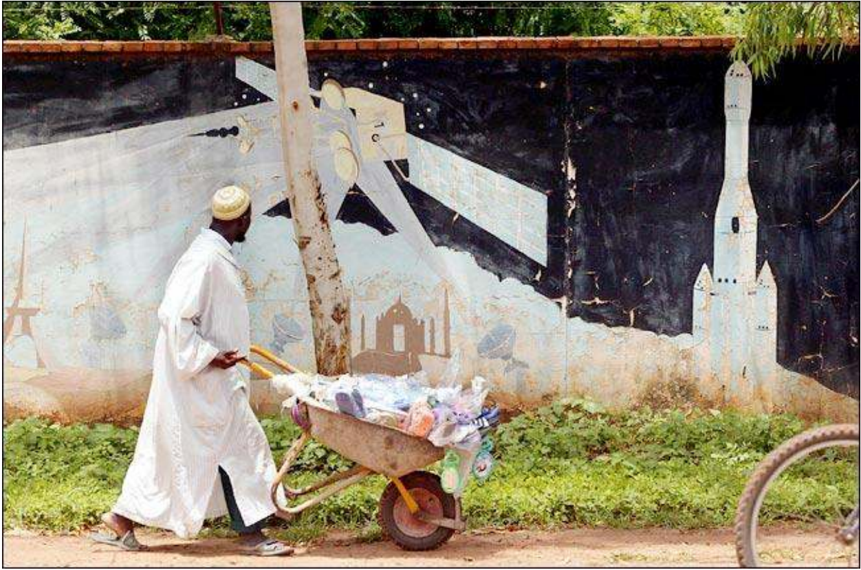
Figure 1: (Michael Kamber)

There exist several major political conflict surfaces: