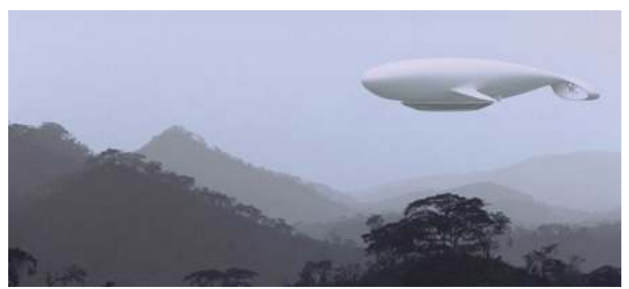
Figure 4: (Manned Cloud by Jean-Marie Massaud)

Isolationists vs. everybody else: Indigos, unmodified, unenhanced and traditional humans regard the rest of mankind as corrupt, decadent, playing gods or just plain immoral. They seek to minimize corrupting biological and memetic contact with the outside world. There are many kinds of isolationists (not all of them Indigos) but they share the fear or disgust with the new world.